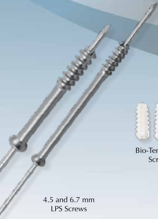
4.5 and 6.7 mm LPS Screws