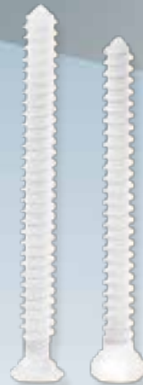
Absorbable TRIM-IT™ Screws